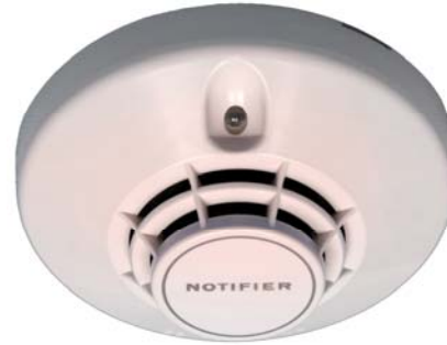
ND-751T-E Intelligent Plug-in Thermal Detector

©2006 Honeywell International Inc. All rights reserved. Unauthorized use of this document is strictly prohibited.